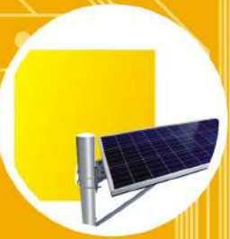
SOLAR STREET LIGHTS