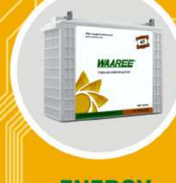
ENERGY STORAGE (BATTERIES)