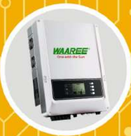
INVERTERS (ON-GRID/ OFF-GRID)