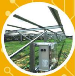
MODULE MOUNTING STRUCTURES