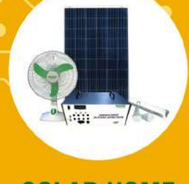
SOLAR HOME LIGHTING SYSTEM